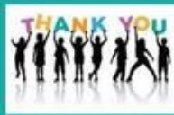
Teacher and Staff Appreciation